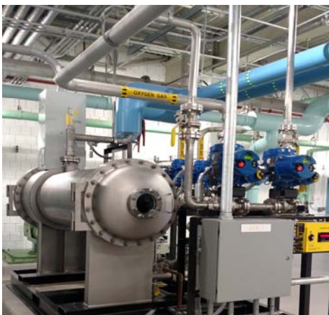
New Ozone System installed in 2017 at CLCJAWA

Our tap water quality is consistently monitored by the Village, by the Illinois Environmental Protection Agency (IEPA), in the CLCJAWA Water Quality Lab, and by other independent labs. This aggressive water quality assurance program is thorough: bacteriological tests are conducted six times more often than required, water clarity is monitored every 10 seconds, and our water is checked for hundreds of contaminants annually.